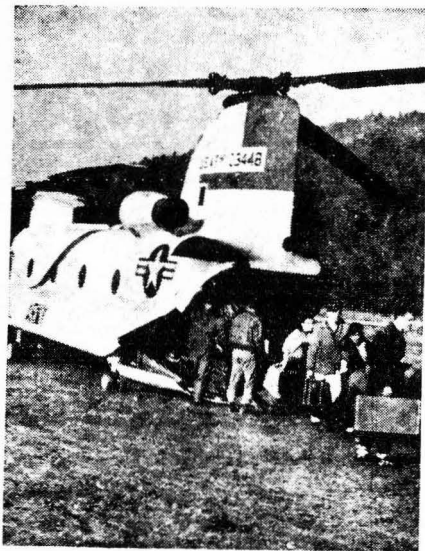
Hoopa High students disembark at Hoopa after a 26-mile flight from Orleans in their unique white "school bus." The large twin-rotor helicopter was also operated during the disaster to haul relief supplies and mail to the stricken valley area.