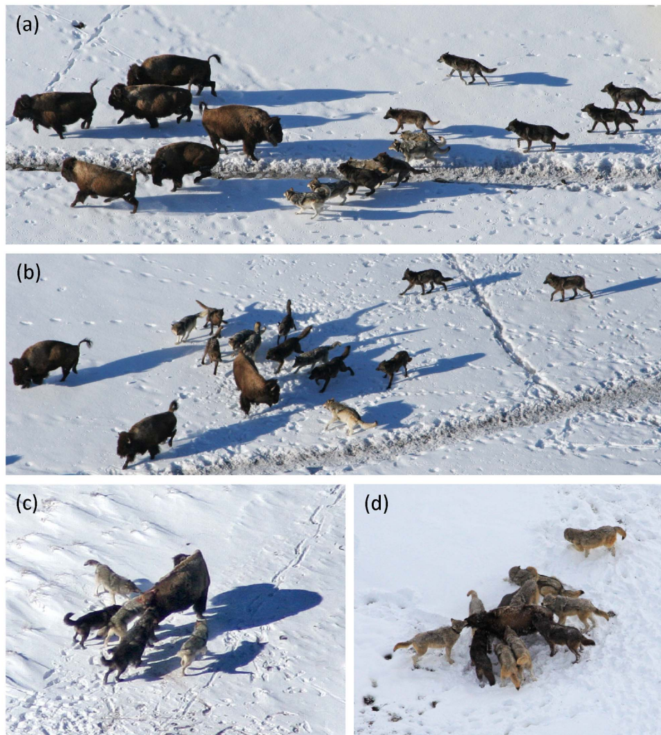
Figure 1. Behavior of wolves hunting bison: (a) approach, (b) attack-individual, (c, d) capture (see Table 1 for definitions). “Attacking” is the transition from (a) to (b), and “capturing” is the transition from (b) to (c, d). doi:10.1371/journal.pone.0112884.g001

Observations of repeated attempts to perform the same task during the same encounter were also correlated, but these were used in only models of capturing, which fitted encounter identity as a random intercept within pack. Models of attacking included only the first attempt because we were mainly interested in how group size affected the probability of attacking on first encountering bison. All models included a compound symmetric correlation structure, which assumed that all observations within