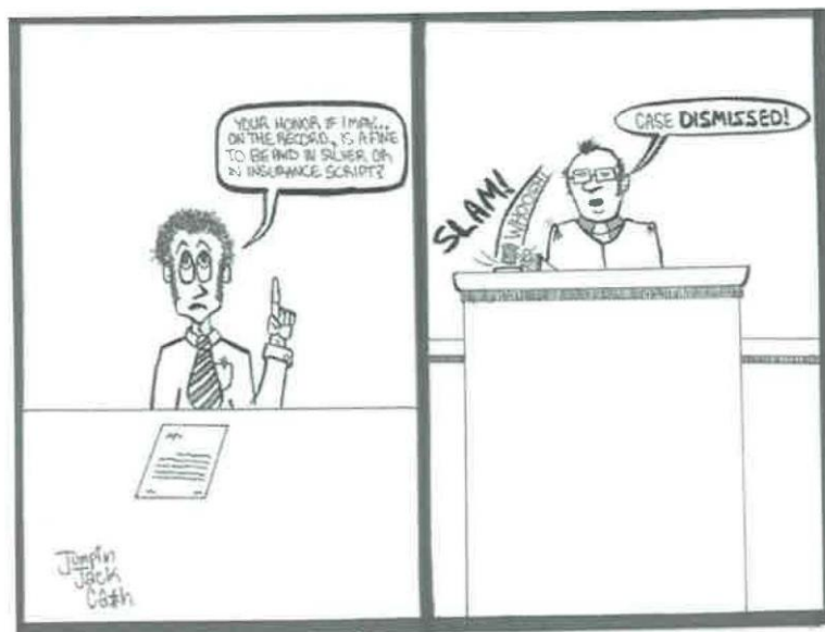
Figure 3- Comic evidence that Sovereigns are successful in court. 113