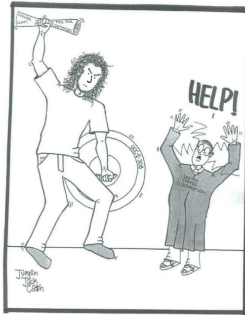
Figure 1- Comic of a Sovereign reclaiming dominance over the U.S. government (or corporation). 82

influence of the groups' perceptual lens. As they take back what they see as their proper place in the United States, Sovereigns become more powerful than officials.