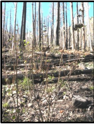
Browsed aspen suckers soon after wildfire in northern Arizona

Regardless of disturbance or aspen type, maintaining aspen resilience is highly dependent on local levels of ungulate herbivory (Seager et al. 2013). In the West, prominent aspen browsers include cattle, sheep, elk, and deer. If great care is not taken to protect post-disturbance and post-treatment stands from