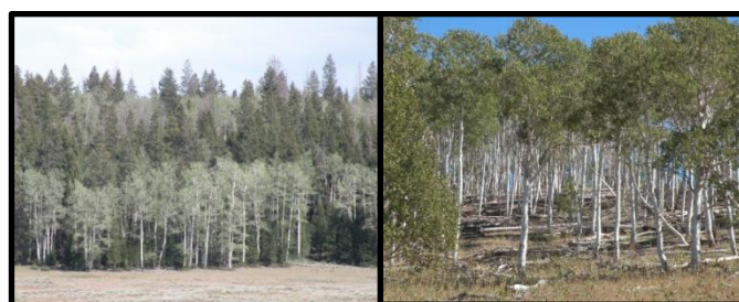
Montane seral (L) and Colorado Plateau stable (R) aspen

use. The elevated level of forest and rangeland burning during this period resulted in many of the mature aspen forests we see today (Kaye 2011).