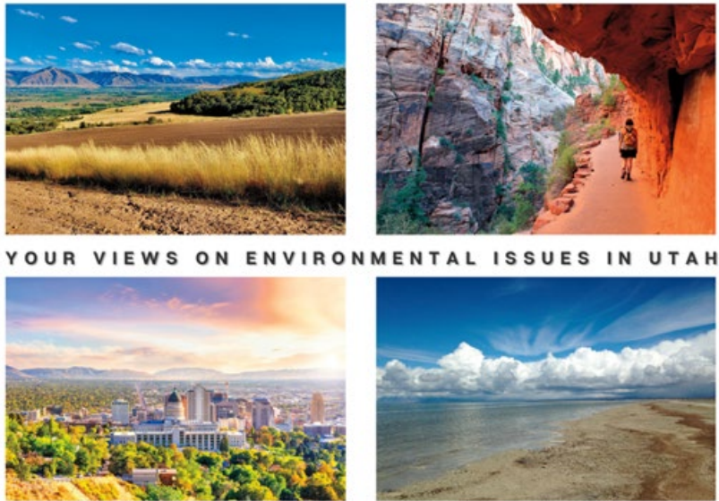
Figure 2. Front of Postcard for Wave 3 of the UPEP

Surveys returned via mail were entered into Qualtrics. Once data collection was complete, the data was cleaned for incomplete responses (<50% of questions answered), non-logical responses, etc. Design weights were applied to account for the within household selection process (i.e., accounting for the number of eligible adults). Rake weights were subsequently applied to make minor adjustments for age, education, and gender. These weights are applied with the exception of open-ended questions.