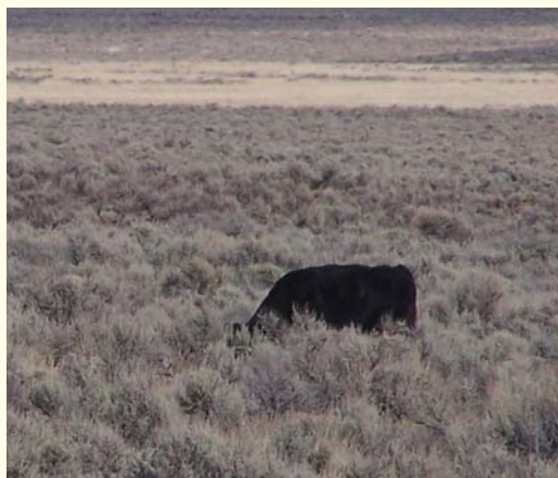
Cattle grazing near one of the SageSTEP sagebrush/cheatgrass study sites.