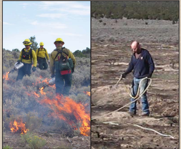
Great Basin residents tend to prefer prescribed fire as a management treatment as proposed to herbicide use.

The key informant interviews revealed similar themes. We spoke with active participants in range management and policy activities in four categories: recreationists, ranching and livestock industry; environmental groups; and education/extension. We also interviewed some public land managers to see if their perceptions matched those of citizen stakeholders.