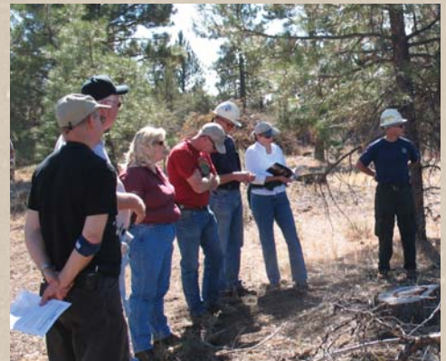
SageSTEP researchers and federal employees on a field tour of the Devine Ridge woodland site in fall 2006.

Each workshop will include a half-day session at a cooperating BLM field office for presentations and discussions and a half-day field trip to one of the SageSTEP sites where treatments have been implemented. BLM and Forest Service personnel, the research team, permittees, and other interested parties are invited. We hope to make these workshops an annual event where researchers and managers can share information. For more information about these workshops contact Nora_Devoe@nv.blm.gov .