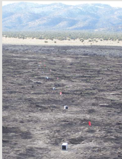
Small mammal traps at Onaqui sagebrush/cheatgrass burned plot.

The results of this study will allow us to understand how rodent communities respond both initially and several years after the application of the ecological restoration treatments considered in this research. The information will prove useful if the management of these organisms is merited in restoration efforts. More information is available at www.sagestep.org/collaborative_projects/ostoja_mammals.html .