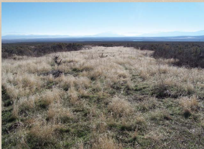
Cheatgrass moving into a disturbed sagebrush community.