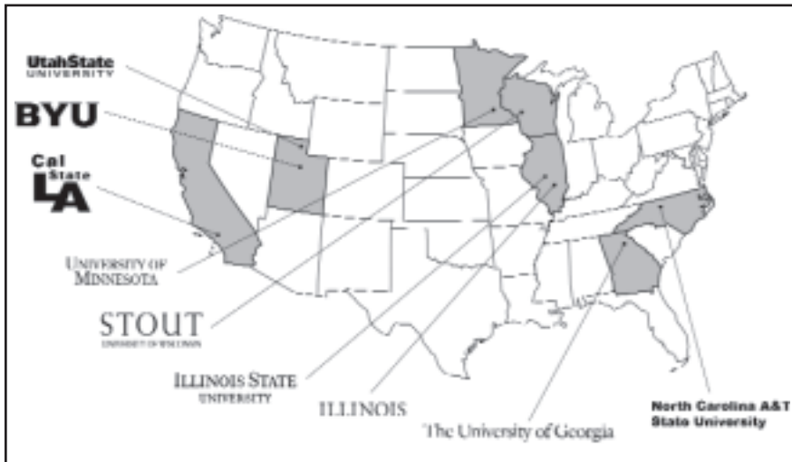
Figure 1: NCETE Partners

development could be applied to many levels. We have chosen to focus on Grades 9 to 12 during the first five years.