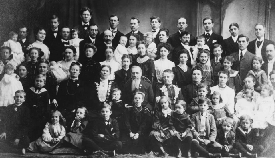
Joseph F. Smith, sixth president of the Church of Jesus Christ of Latter-day Saints, with his wives and children, ca. 1900.

servants” in the life to come. 30 However, if a marriage is “sealed . . . by the Holy Spirit of Promise, by him who is anointed, unto whom [God has] appointed this power,” 31 then the marriage would endure beyond death, and the parties would be entitled to a “far more, and an exceeding, and an eternal weight of glory.” 32 In fact, to obtain the highest salvation, a person has to “enter into . . . the new and everlasting covenant of marriage.” 33 As one scholar put it, Mormon salvation is essentially a family affair. 34 The revelation warned of heavy consequences to those who refused to accept polygamy: “For behold, I reveal unto you a new and an everlasting covenant; and if ye abide not that covenant, then are ye damned; for no one can reject this covenant and be permitted to enter into my glory.” 35