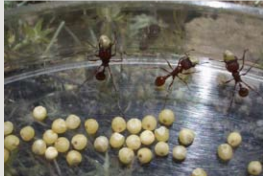
Western harvester ants ( Pogonomyrmex occidentalis) removing millet from a seed tray in a seed-removal trial.