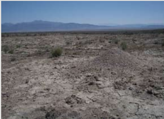
Ant nest on Onaqui burn plot.

The researchers are looking at how ant foraging behavior, fate of ant-collected seeds, and seedling establishment with and without harvester ants are influenced by cheatgrass density and management treatment. This study is being conducted at the SageSTEP Onaqui sagebrush/cheatgrass study site, which includes four management treatments on 75-acre plots: prescribed burn, mechanical thinning (mowing), herbicide (tebuthiuron), and control. Western harvester ant ( Pogonomyrmex occidentalis ) colonies have been selected throughout the plots at various cheatgrass densities (low, medium, high) and across the range of treatments. Data collection began in 2006 and will continue until 2010 and takes place twice a season (early June and late July).