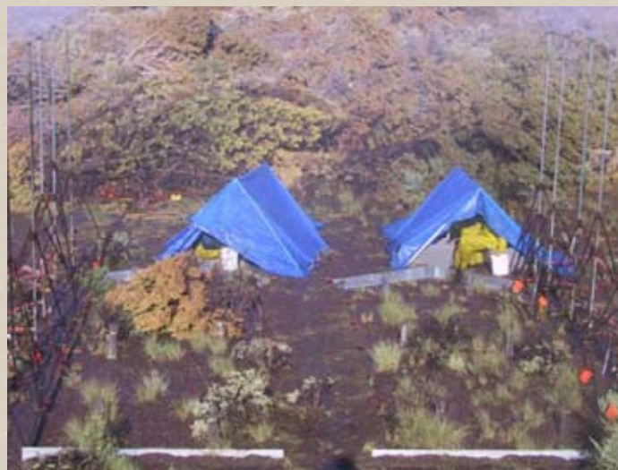
Large plot rainfall simulation after tree cutting at the Marking Corral site.

Runoff and erosion at the large plot scale were greater from shrub-interspace (varying amounts of shrub and interspace areas) than tree patches (area under trees with varying amounts of interspace area). Greater average runoff rates are related to greater proportions of interspace to coppice area within shrub-interspace patches. Tree coppice mounds cover a larger surface area than shrub coppices and have greater litter depths. These data indicate tree patches have greater rainfall storage and/or infiltration