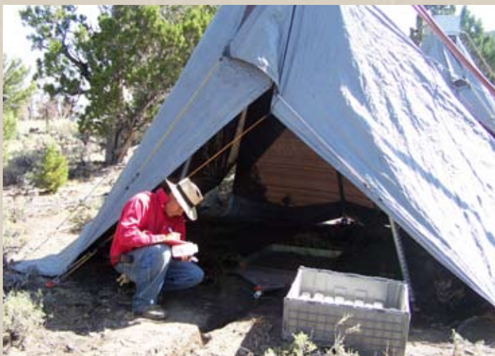
Small plot rainfall simulation at the Marking Corral site.

and erosion across a gradient of vegetation and ground cover in interspace areas and areas underneath tree and shrub canopies (coppices). Soil water repellency and ground cover factors that influence runoff and erosion are measured at each site. Pre-treatment data were collected at the Marking Corral and Onaqui sites in 2006 and serve as a baseline data set to evaluate hydrologic effects of woodland control treatments. Data collection at the Castlehead site began in May of 2008. This article presents preliminary results from the 2006 pre-treatment data collected at the Marking Corral and Onaqui study sites.