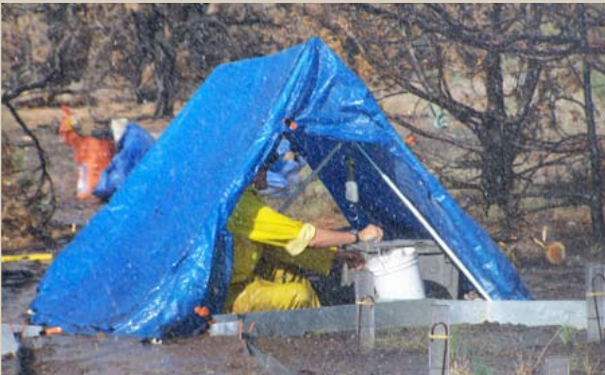
Runoff and sediment sampling on large rainfall simulation plot.

Hydrologic experiments are being conducted at one western juniper (Castlehead, ID), one Utah juniper (Onaqui, UT), and one pinyon-Utah juniper (Marking Corral, NV) site within the greater SageSTEP study area (see map on p.5). Experiments are implemented within woodland areas prior to tree removal (pre-treatment) and within areas that have been treated by burning, cutting and bullhog tree removal methods. Artificial rainfall simulations at the small (0.5 m 2 ) and large plot (13 m 2 ) scales, and concentrated flow experiments are being used to quantify runoff