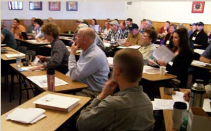
Workshop participants listen to an overview of the SageSTEP study.

The Learning Together in SageSTEP 2008 Oregon manager workshop was held May 6-7, in Burns, Oregon. There were over 60 participants from Oregon, Idaho, California, Utah, and Nevada representing SageSTEP, the Bureau of Land Management (BLM), USDA Forest Service, Natural Resource Conservation Service (NRCS), and non-governmental organizations. The workshop was conducted to give participants an overview and update of the SageSTEP experiment and to bring researchers and managers together to discuss how study results can be most useful to those working on the ground.