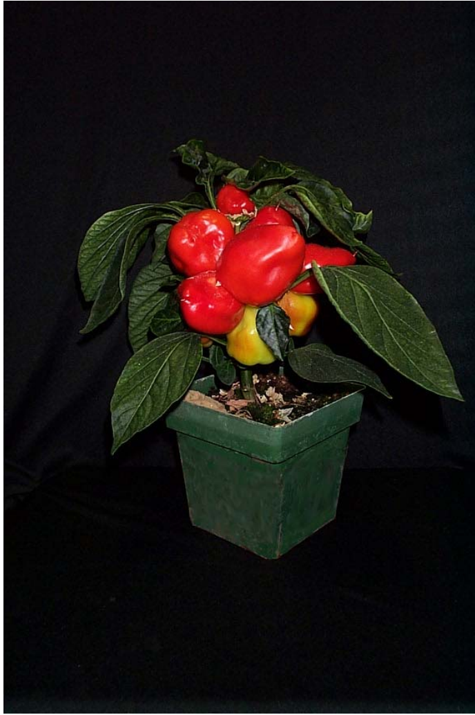
'Triton' fruit turn bright red when mature. In this photo, the peppers are about 80 days old. Each plant produces about 6 to 8 fruit.