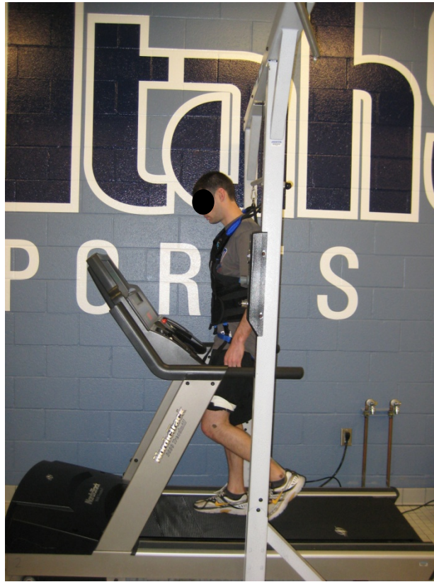
Figure 2. The Pneumax body weight support unloader.