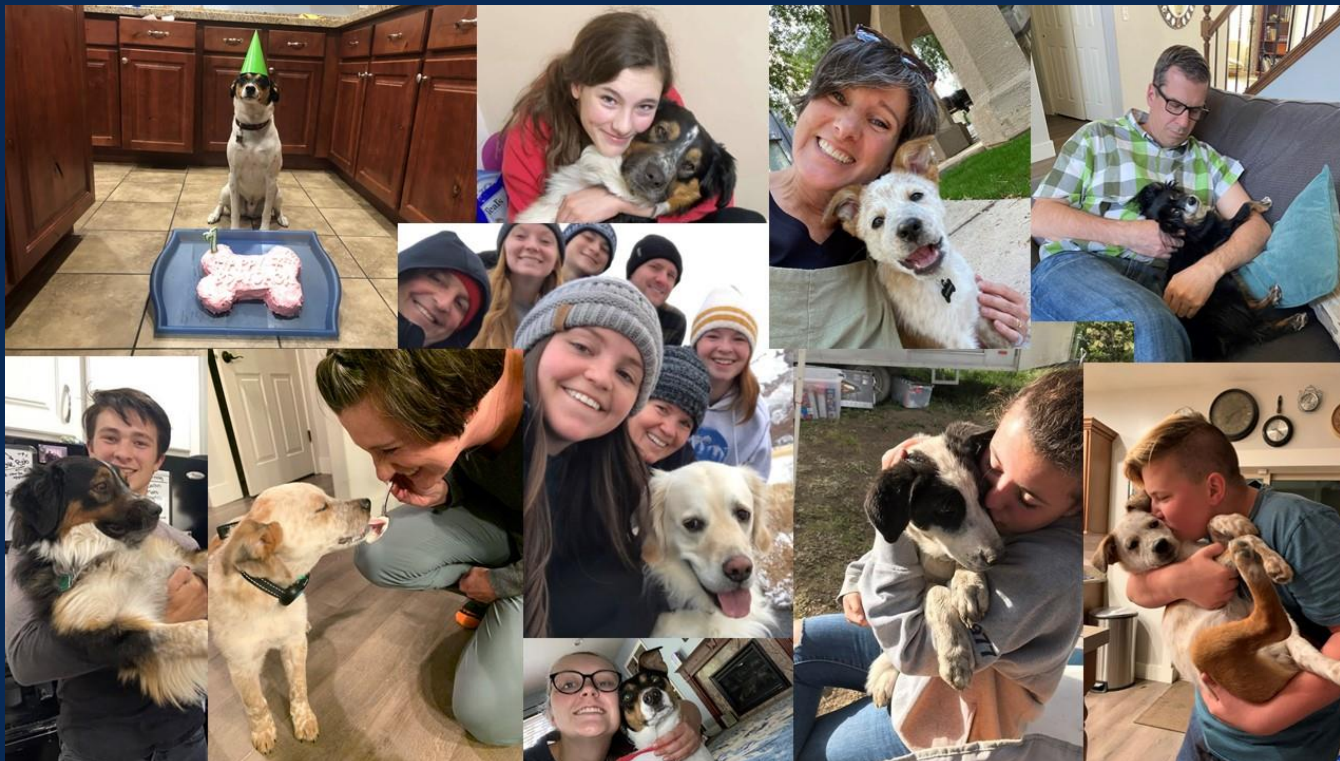
Our bonds with our dogs are evident in every aspect of life and society.