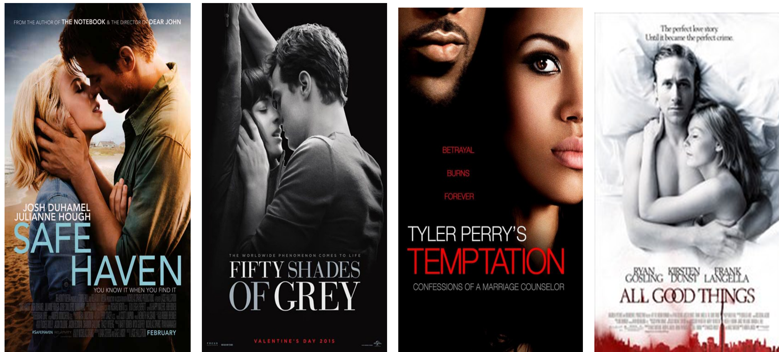
Figure 1: Motion pictures analyzed