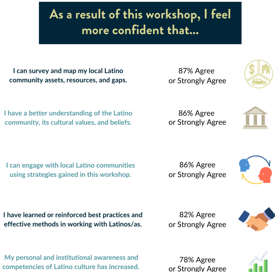
Figure 2: Evaluation Results from the 2019 Cultural Competency workshop

Evaluation results from the 2017 session targeting 4-H and youth development Extension professionals indicated 78% of participants were confident in their ability to integrate Latino outreach strategies in their 4-H programs ( n = 17 ). One participant stated “I would really like a follow-up webinar session. Love the toolkit that was provided at the training.” In addition, workshops tailored to the Create Better Health and the Expanded Food and Nutrition Program teams in 2019 were well-attended; 76 Extension staff and nutrition paraprofessionals responsible for nutrition education programs participated in two half-day Cultural Competency sessions. Figure 3 summarizes responses from Create Better Health training ( n = 39 )