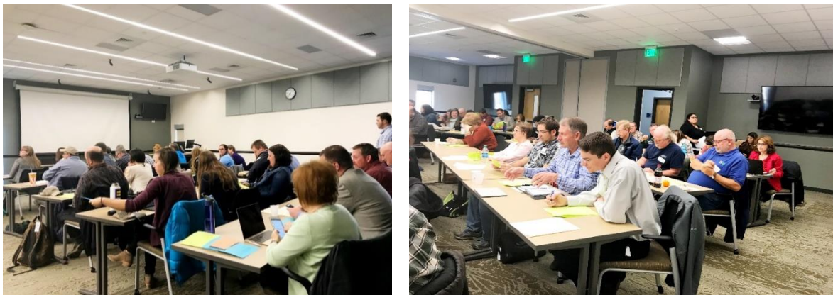
Figure 1: Latino Cultural Competency Workshops at USU Extension

During the workshops, participants, (a) completed a personal and institutional self-assessment using a questionnaire to determine their current cultural competence level and their institution; (b) attended presentations on cultural values and best practices; (c) carried out community mapping activities to assess resources and evaluate current knowledge of their Latino communities; (d) completed a SWOT [Strength, Weakness, Opportunities and Threats assessments] group activity; (e) participated in a World Café activity to compile group brainstorming on Latino outreach ideas, and (f) completed a workshop evaluation. The workshops for 4-H and youth development professionals and for the nutrition education teams were tailored to focus on subgroups of Latino culture.