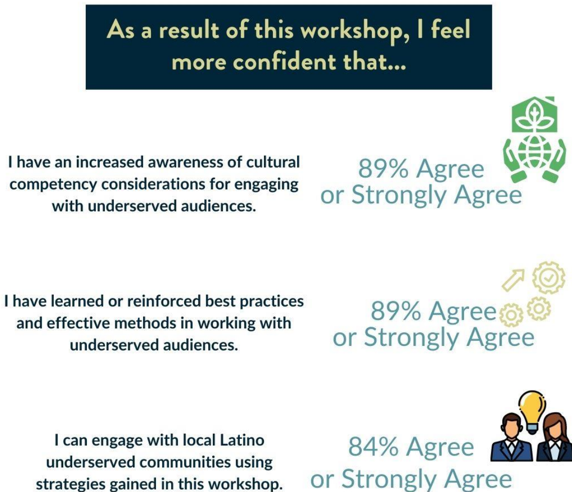
Figure 3: Evaluation Results of the Create Better Health workshop

In 2021, follow-up evaluation data was gathered via a Qualtrics survey from all participants who attended at least one of the Latino Cultural Competency sessions. It assessed the extent to which the Latino Cultural Competency series motivated Extension faculty to plan and implement programs to reach Latino audiences. Figure 4 illustrates participant's responses ( n = 57 ). Results show about 52% of Extension professionals who attended a workshop have engaged in some form of Latino programming. In addition, over half the number of participants in the series were engaged in program planning activities, implemented educational programs, or developed resources for Latino audiences.