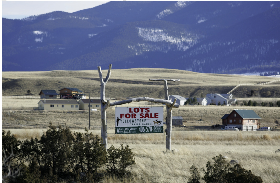
Figure 5. Impacts from excessive numbers of elk and deer threaten the financial sustainability of traditional cattle ranches, making them more likely to be sold for rural development or sold to amenity owners who prohibit hunting. A , of elk grazing private ranchland on the Northern Range. B , of rural residential development on the Northern Range.