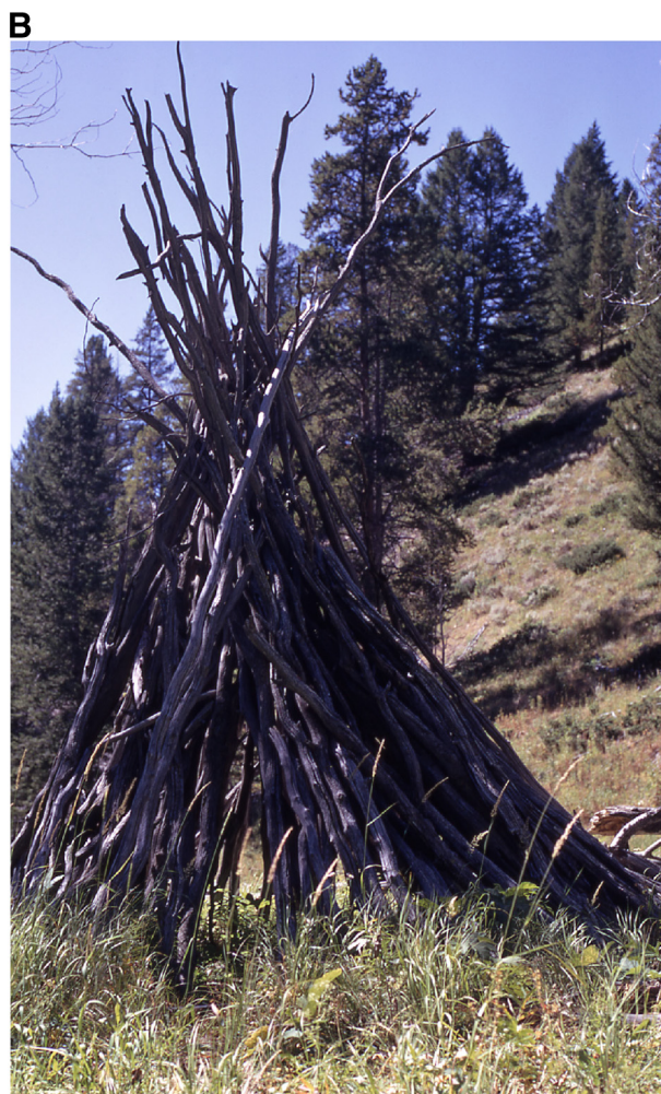
Figure 2. Wickiups (i.e., brush tipis) were commonplace throughout the Northern Range inside and outside Yellowstone National Park (YNP) when the park was created. A , National Park Service photo of a Bannock wickiup in 1871. B , A remnant wickiup inside YNP in 1970. National Park Service photo by William Dunmire.

Ancient and more contemporary Native American structures have been found on the Northern Range. A 5,000-year-old fire hearth has been documented at Rigler Bluffs near Corwin Springs, Montana, about 12 miles north of the YNP boundary, and a group of 5,000-year-old tipi rings has been