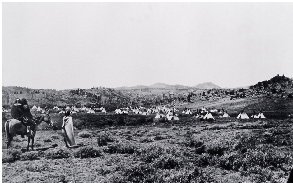
Figure 3. Euro-American explorers, and later visitors to Yellowstone National Park, frequently encountered Native Americans on the Northern Range during the 1800s. National Park Service photo of a Shoshone encampment in 1871.

documented closer to the YNP boundary at Cinnabar, Montana. 6p26 Twelve additional sites with tipi rings have been documented on the Northern Range outside YNP, and several wickiups (i.e., brush tipis made from downed trees and branches, shrubs, and grass) also have been found on the Northern Range, inside and outside YNP (Fig. 2). 2,7 In fact, Colonel Philetus Norris, second superintendent of YNP, reported in 1880, 8 years after YNP was established, that wickiups were abundant “in nearly all of the sheltered glens and valleys” of YNP. 8p35 Native American pictographs, petroglyphs, burial sites, and hunting blinds also have been documented on the Northern Range. 2,3,4p170–171,9p982