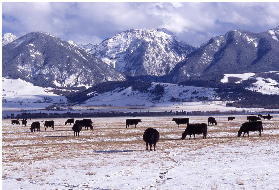
Figure 4. Cattle ranching contributes significantly to the economy and culture of the Northern Range, and numerous species of wildlife depend on privately owned ranchland for winter and summer habitat. In turn, hunters depend on traditional cattle ranchers for access to private ranchland for hunting, and ranchers and wildlife biologists depend on hunters to regulate elk and deer populations.  of a private cattle ranch near the northern edge of the Northern Range.

boundary until about 1905. 28,29p41 One Northern Range rancher, Joseph Duret, allegedly allowed or encouraged his cattle to cross into YNP from his ranch on Slough Creek circa 1914 to 1922. 28 The area from the YNP boundary north to Yankee Jim Canyon was heavily grazed by cattle and horses until 1926. 29p42