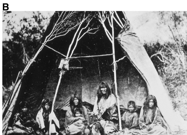
Figure 1. The Northern Range inside and outside Yellowstone National Park (YNP) had been the homeland of Native Americans for millennia when YNP was created in 1872. A, Nez Perce encampment along the Yellowstone River. B, A lodge of Tukudika, the eaters of meat.

famous quarry is inside YNP at Obsidian Cliff where millions of stone artifacts attest to “the vast amounts of stone tools produced at Obsidian Cliff over the past 11 millennia.” 4p84 Chert is another rock used by Native Americans to make stone tools, and a large chert quarry exists on the Northern Range inside YNP at Crescent Hill. 4p94