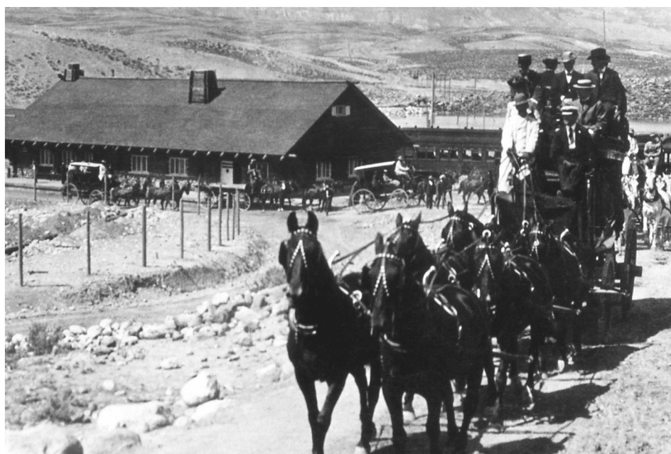
Figure 6. Millions of tourists have visited and impacted the natural environment of the Northern Range during the past 146 years. Impairment of the Northern Range ecosystem is unavoidable given the large number of visitors, with nearly 4 million people in 2017 alone. National Park Service photo of stagecoaches bringing tourists from the Gardiner Train Depot to Mammoth in 1904.

YNP to facilitate transporting people and supplies. 29p41 Automobiles were not allowed inside YNP until 1915, and stagecoaches were replaced with buses and cars in 1917.