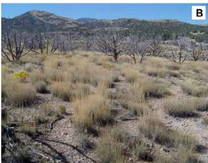
Figure 2. Onaqui SageSTEP Hydrology Site in 2006, the year of prescribed fire treatment (A) and 8 years after prescribed fire in 2014 (B). Note the dramatic change in intercanopy grass productivity after fire.