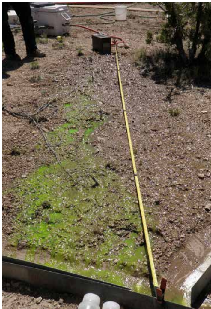
Figure 1. Overland flow experiment in degraded intercanopy area of untreated woodland at the Onaqui SageSTEP site. Dye shows area of high velocity concentrated flow and soil erosion.

infiltration and storage of intercepted rainfall and overland flow and that protect the soil surface against erosion forces. In contrast, the intercanopy area can be more than 80% bare and often represents more than 75% of the total area at a site. Hydrologically, this leaves a site relatively unstable because of the lack of understory vegetation to absorb runoff and prevent flowing surface water from removing critically important surface soil (Figure 1).