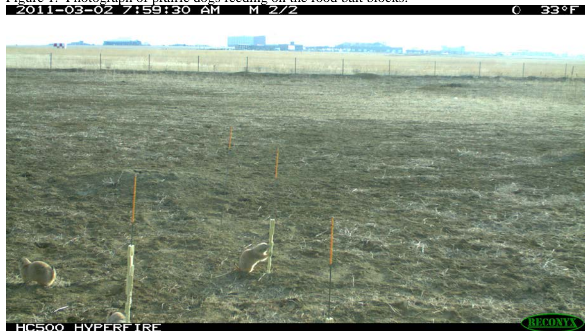
Figure 1. Photograph of prairie dogs feeding on the food bait blocks.

a Sites A, C, E and F were operated for 19 days with a total of 1404.2 g of food bait was presented, whereas Sites B and D were operated only 12 days with a total of 1003 g of food bait presented.