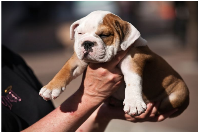
Figure 1: Puppy Face Dog (Eschner, 2018)

Within the last few hundred years, people have been breeding dogs for specific traits and qualities (Nesathurai, 2019). Dog breeds, including pugs, golden retrievers, and border collies, have developed from this breeding. Even though some of the origins date back further in history, many of these breeds have had many selective pressures on specific traits for show or just simple appeal (Eschner, 2018). This inbreeding has been the cause of many health issues: such as trouble breathing, hip and back problems (Nesathurai, 2019).