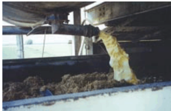
Figure 3: Adding liquid cheese whey to mixer.