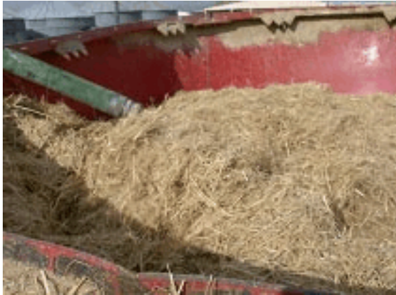
Figure 1: Mixing of individual feedstuffs with whey.

Whey silage was produced for the six individual studies using the feedstuffs and proportions shown in Table 2 (Figures 1-4).