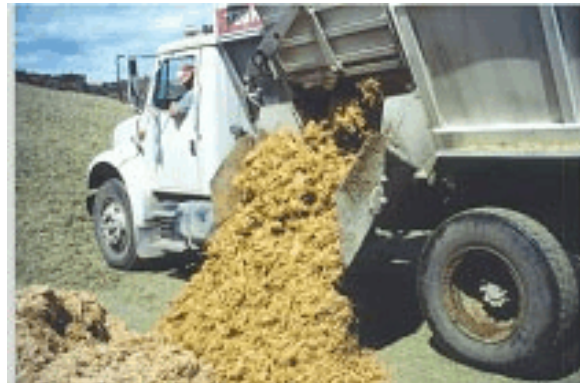
Figure 4: Final product or whey silage.

The ingredients were combined in a feed mixer for studies 1, 2 and 4 and packed in an open bunk silo. For Studies 3, 5 and 6 the individual feedstuffs were combined in a feed mixer and placed in a silage bag. The feedstuffs combined sufficiently well and there was little runoff of excess liquid whey after allowing approximately 10 minutes of mixing time. The whey silage was “cured” for a period of 3-4 weeks before nutrient analysis of silage was performed (Table 2). Representative samples of each feedstuff were collected periodically during each of the studies for nutrient analysis.