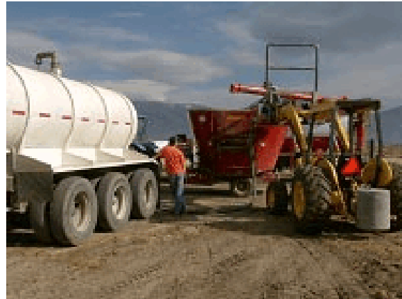
Figure 2: Adding various feedstuffs.