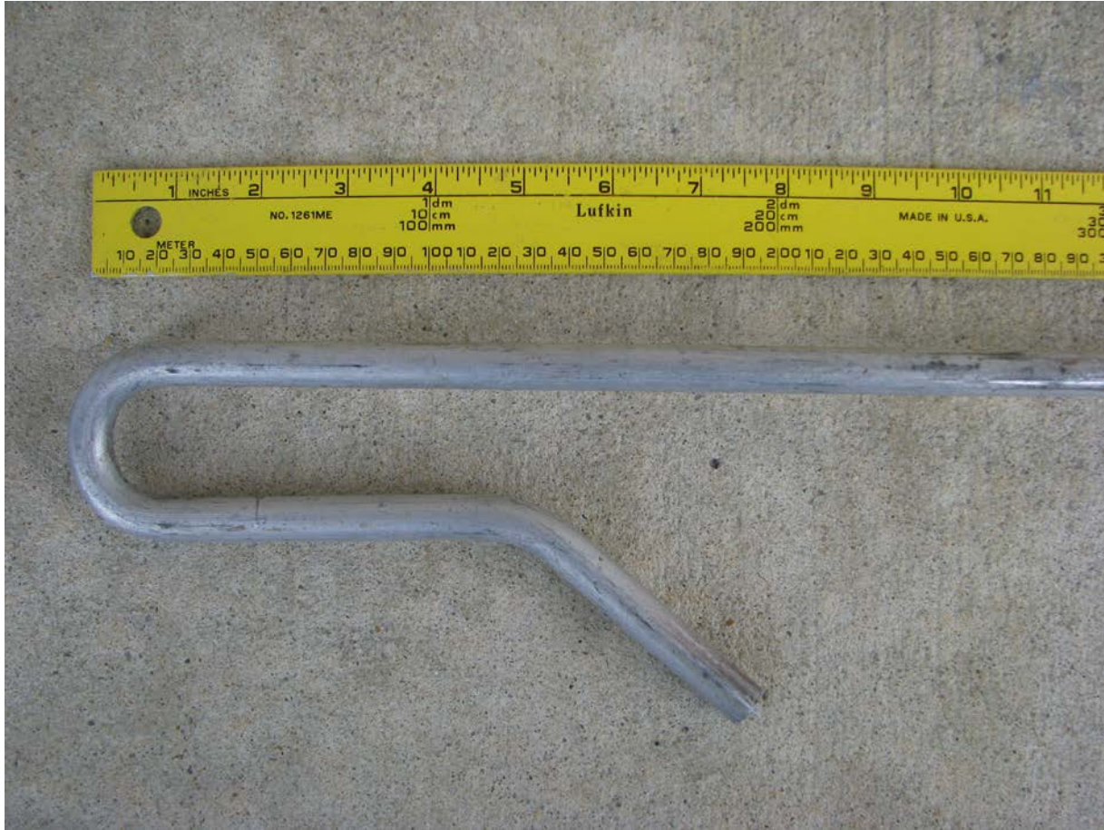
Figure 1. Distal end of telescopic, aluminum swan pole (3.2-cm crook gap) made of marine-grade aluminum rod (0.6-cm) used to capture flightless mute swans in the lower Potomac River and upper Chesapeake Bay, Maryland, USA, 2005–2008.

(for example, 1,396 swans/44-culling hours = 31.88 swans culled per hour).