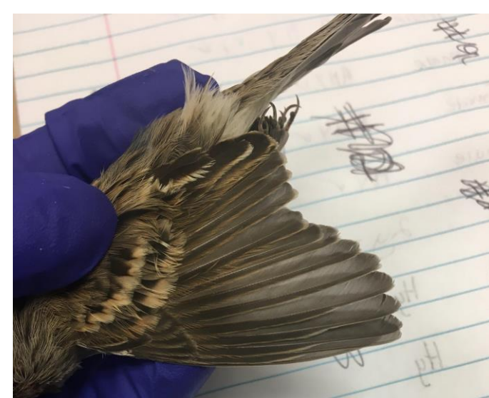
Figure 1. Lincoln Sparrow

After performing a walk around the C&SS. If a bird, or a part of a bird indicating a collision, was found we applied proper protective equipment and picked up the specimen from the place it was found. The specimen was then placed in a cooler to await further analysis of age and identification. Birds were aged by plumage condition and skull development.