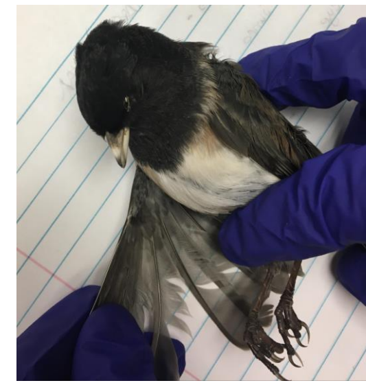
Figure 2. Brown Eyed Junco