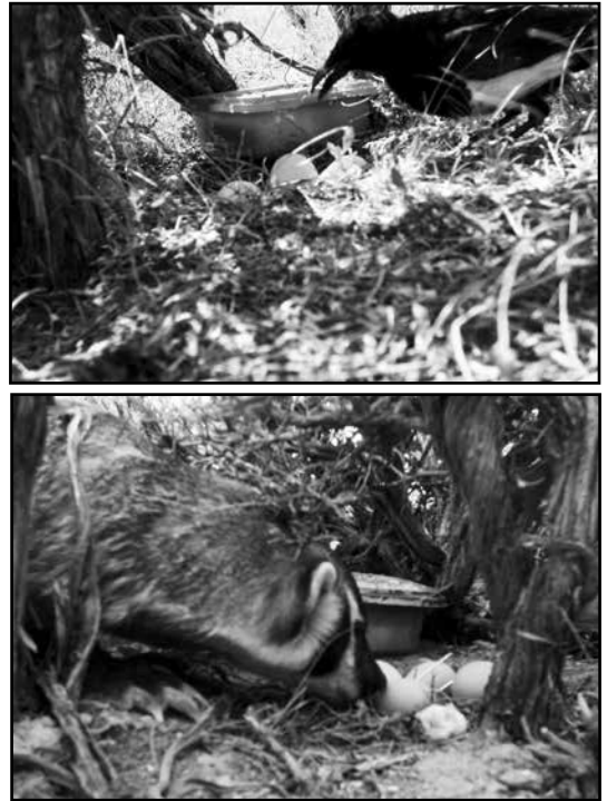
Figure 1. Nest camera images of a magpie and badger depredating an artificial nest that was previously occupied by a sage-grouse hen.

We found 195 natural sage-grouse nests during 2010 and 2011, and set up artificial nests in 32 successful and 37 unsuccessful nests of those sage-grouse. One artificial nest from a successful sage-grouse nest was eliminated from analyses because information on that artificial nest’s fate was not recorded by observers. There were 13 (19%) depredations of artificial nests within the 14-day observation period. To assess the effect of corvid densities on depredation of artificial nests, we conducted 1,690 point count surveys at 336 random locations during 2010 and 2011. We counted 277 ravens and 45 magpies within species specific EDRs (600 m and 300 m, respectively). Cameras were deployed at 24 artificial nests, with eight of these nests having depredation events (4 badgers, 2 magpies, 1 domestic cow, and 1 camera failure; Figure 1). We did not statistically analyze our camera results due to