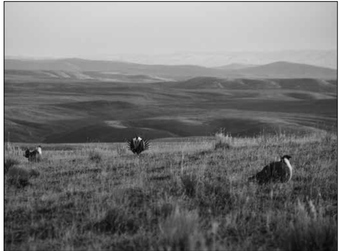
Figure 1. Sage-grouse in Utah.

Our study focused on sage-grouse populations inhabiting the Sheeprock and Deep Creek watersheds in the West Desert sage-grouse conservation area. The sage-grouse conservation area encompassed 2 million ha (Figure 2; WDARM 2007). The Sheeprock Watershed (490,943 ha) was located on the eastern side of Utah's West Desert, approximately 120 km east of the Deep Creek Watershed (269,929 ha). The 2 study sites were separated by the southern end of the Great Salt Lake Desert. Elevations in the study areas ranged from 1200 to 2200 m. There was no evidence that sage-grouse inhabited or used