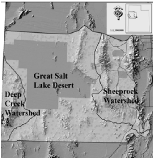
Figure 2. The West Desert study area showing the Deep Creek and Sheeprock watersheds study sites, separated by the Great Salt Lake Desert, Utah, USA.

landowners, with USFS and BLM grazing allotments being essential to their operations (WARM 2007). The Sheeprock Watershed also had a large population of wild mustangs ( Equus ferus caballus ). Lower elevations were dominated by crested wheatgrass ( Agropyron cristatum ) interspersed with Wyoming big sagebrush ( A. tridentata spp. wyomingensis ). Both watersheds at lower elevations were dominated by saltbush ( Atriplex spp.) and greasewood ( Sarcobatus spp.). At mid-elevations, the dominant shrub species was Wyoming big sagebrush interspersed with silver sagebrush ( A. cana ) in the mesic drainages. As elevations increased, the vegetation included a variety of shrubs, such as Saskatoon serviceberry ( Amelanchier alnifolia ), common snowberry ( Symphoricarpos albus ), antelope bitterbrush ( Purshia tridentata ), chokecherry ( Prunus virginiana ), and stands of juniper ( Juniperus spp.). At the higher elevations, mountain big sagebrush ( A. t. vaseyana ), and quaking aspen ( Populus tremuloides ) dominated the drainages. Douglas rabbitbrush ( Chrysothamnus viscidiflorus ) and rubber rabbitbrush ( C. nauseous ) occurred throughout the study sites at all elevations.