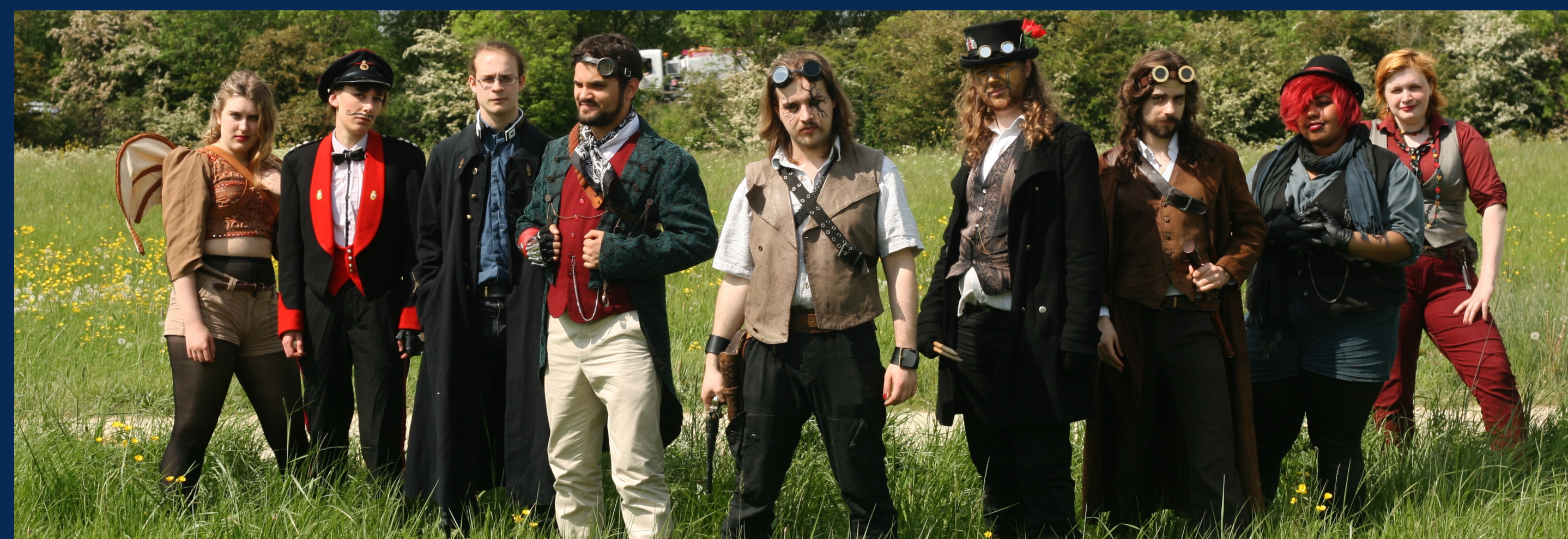
Figure 1 – The Mechanisms in 2014