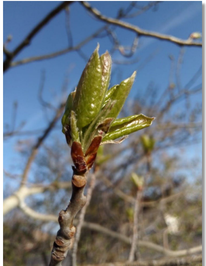
Ah, spring! Nothing symbolizes this change of season like the bursting of buds. The delicately packed aspen leaflets unfurling with each warmer day spell promise even before their first flutter. In time, these leaves will act as nature's solar panels, garnering precious sunlight and converting it to carbohydrate energy for growth and storage.

Update on WAA Membership —The WAA has reached another milestone with 700 members spanning North America and 11 countries total. Recent patterns confirm strong USFS and university participation and notable surges in citizen, NGO, BLM, and State Wildlife agency membership.