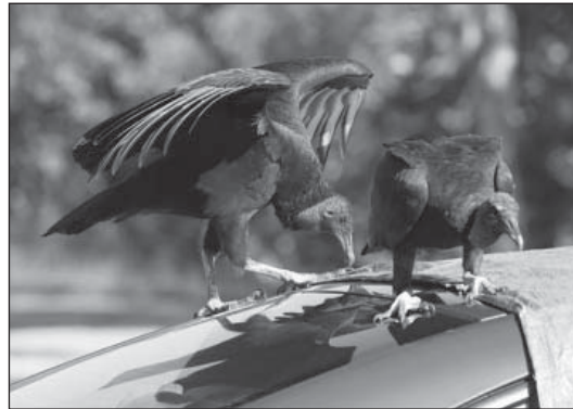
Figure 2. Vultures on cars.

Officials from the Army Corps of Engineers at the Bull Shoals Dam in Arkansas experienced problems with black vultures ( Coragyps atratus )