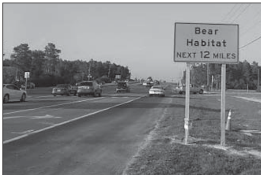
Figure 3. Bear warning sign

Wildlife officials were forced to euthanize a black bear ( Ursus americanus ) after a collision with an Emergency Medical Services truck near Naples, Florida, a local news station reported. Prior to the collision, the bear had been seen scrounging through dumpsters in nearby neighborhoods for food. State wildlife officials warn people to be careful when driving at night, as collisions with animals are common throughout South Florida (Figure 3). Animal-vehicle collisions account for the majority of black bear and Florida panther ( Puma concolor coryi ) deaths in the state because roads separate habitat areas. Projects such as panther passages allow animals to cross under roadways, reducing the number of animal-vehicle collisions.