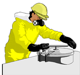
Pesticides Fact Sheet