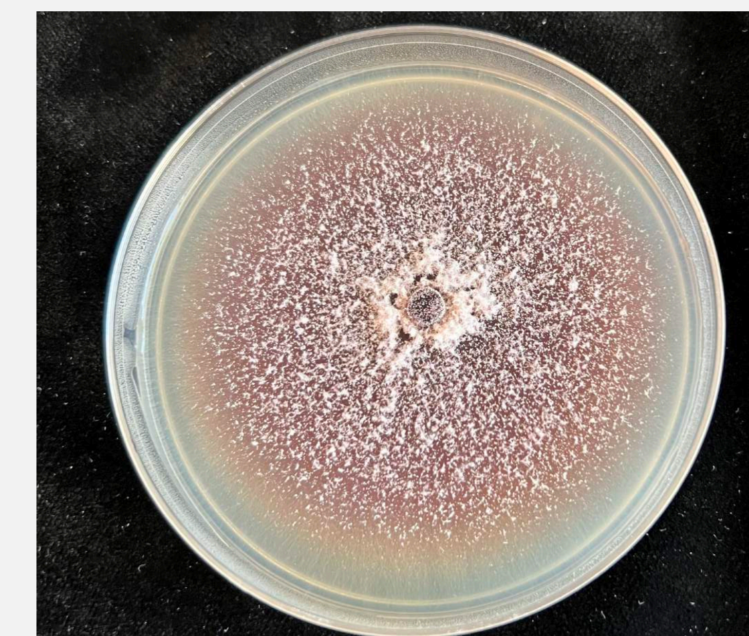
Pictures above depict Fusarium proliferatum grown on media mixed with different fungicides. From left to right: Pristine, Luna Tranquility, and a nontreated control.