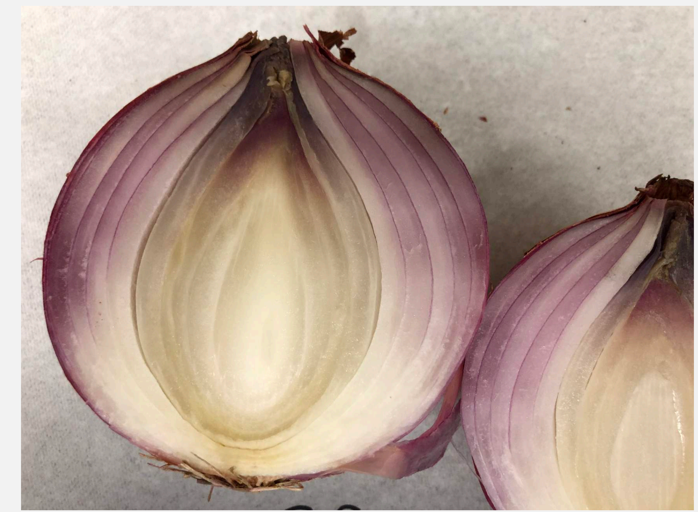
These images show onions infected with Fusarium proliferatum .