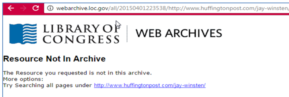
Figure 2. An example of a “Resource Not in Archive” in the Library of Congress Web Archives

In analyzing what was crawled and comparing to what was not crawled (the URLs remaining), the reports suggested that materials were not harvested, resulting in what we would have in our collections as incomplete. Anecdotally, in what could be called a hands-on “click-click” quality review of the result, too many documents turned up “Not in Archive” (see Figure 2) as we randomly clicked through pages in the archived version of HuffingtonPost.com.