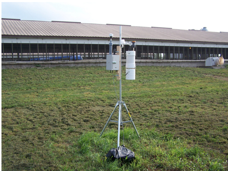
Figure 1. Particle and NH_3 samplers near pig barn

Based on historical meteorological data, portable PM_{2.5}/PM_{10} and NH_3 samplers were deployed in a generally north-south array in and around the facility. Most of the samplers were deployed on tripod supports at a height of about 2 m above ground level (see Figure 1). Additionally, elevated samplers were placed on a meteorological tower between two of the barns and on a second tower in a cornfield to the north of the facility.