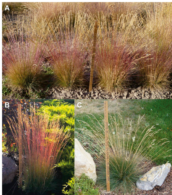
Fig. 1. Examples of selections for red coloration and plant habit within a putative Festuca idahoensis \times F. ovina population, FEID 9025897 originating in Montana: (A) upright and inclined plant habits, (B) upright habit, (C) demonstrates pendulant inflorescences.

Seven F. idahoensis accessions, 'Nezpurs' [PI 601053 (ploidy of 4x )], 'Joseph' [PI 601054 ( 4x )], PI 344597 ( 4x ), PI 344604 ( 4x ), PI 344609 ( 4x ), PI 344614 ( 4x ), and PI 344631 ( 4x ), and three F. ovina cultivars, Durar [PI 578732 ( 6x )], Covar