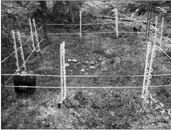
Figure 3. Example of field set-up for testing fences (design C is pictured) for excluding black bears from bait sites in the Beaver Lake Hunt Club, Lachine, Michigan, June to August 2010.

may view as sub-optimum to keep costs and assembly or disassembly times low. We found that two of the designs we tested (Designs B and D) were 100% effective at preventing bait access. Gates et al. (1978), Reidy et al. (2008), Tolhurst et al. (2008), and Honda et al. (2009) evaluated electric fence effectiveness for different species (i.e., coyotes ( Canis latrans ), feral swine ( Sus scrofa ), badgers ( Meles meles ), raccoon dogs ( Nyctereutes procyonoides ), and masked palm civets ( Paguma larvata )), using the same criterion for evaluation (i.e., access to attractant). All agreed that a properly designed and maintained fence is an important tool for the prevention of damage caused by wildlife. Reidy et al. (2008) observed that juvenile swine successfully breached fencing more frequently because of their small size. We made a similar observation; small bears ( \leq 0.5 m at the shoulder) successfully breached fences more frequently than larger bears. Given that each fence design received a comparable amount of bear attention, that all designs were breached, but only 2 designs kept bears away from the bait, and that Design D allowed the fewest breach events per BFI where no fence damage occurred, we designated Design D as the preferred fence design for excluding black bears from bait.