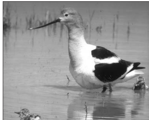
Figure 3 . American avocet ( Recurvirostra americana ) and young.

Food habit studies of eared grebes on the GSL have been conducted during migration and staging and have reported that adult brine shrimp were an important part of eared grebe diets (Table 1). During the early fall, eared grebes consumed both brine shrimp and brine fly adults (Paul 1996, Conover and Vest 2009); by late November, they ate brine