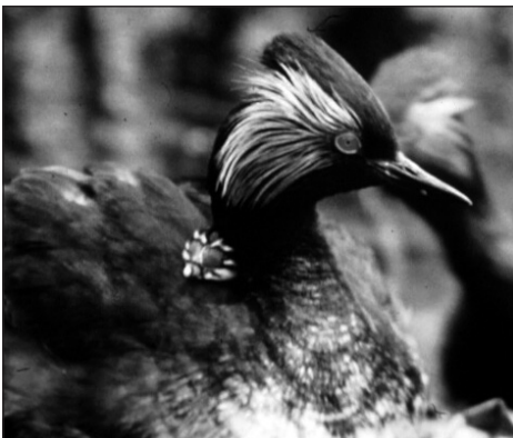
Figure 2 . Eared grebe ( Podiceps nigricollis ).

Early dietary studies often were combined with examination of food items found throughout the birds' digestive tract. Material collected from the proventriculus and ventriculus may represent a biased sample toward hard, difficult-to-digest food items. Recent studies recognize this bias and use only the esophagus when examining food habits. Where the distinction is made in the original publication, I state which part of the dietary tract food items were sampled.