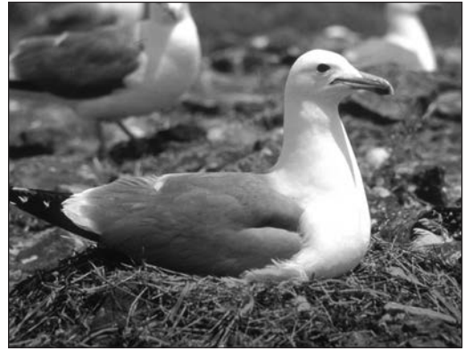
Figure 4. California gull ( Larus californicus ).

Wilson's phalaropes and red-necked phalaropes both use the GSL extensively during fall migration, particularly from July through October. Phalarope species are the only shorebirds that regularly occur in pelagic areas of the GSL, and the GSL hosts >50% of North America's Wilson's phalaropes each fall. Throughout their range, Wilson's phalaropes forage on brine shrimp, as well as brine fly larvae, pupae, and adults (Table 1). Three birds collected from shallow water mud flats of the GSL in 1984 had consumed solely adult brine flies (Mahoney and Jehl 1985a). Colwell and Jehl (1994) found age difference in foraging exists among Wilson's phalaropes, with adults consuming a mix of brine shrimp, brine fly adults, and other aquatic invertebrates, while