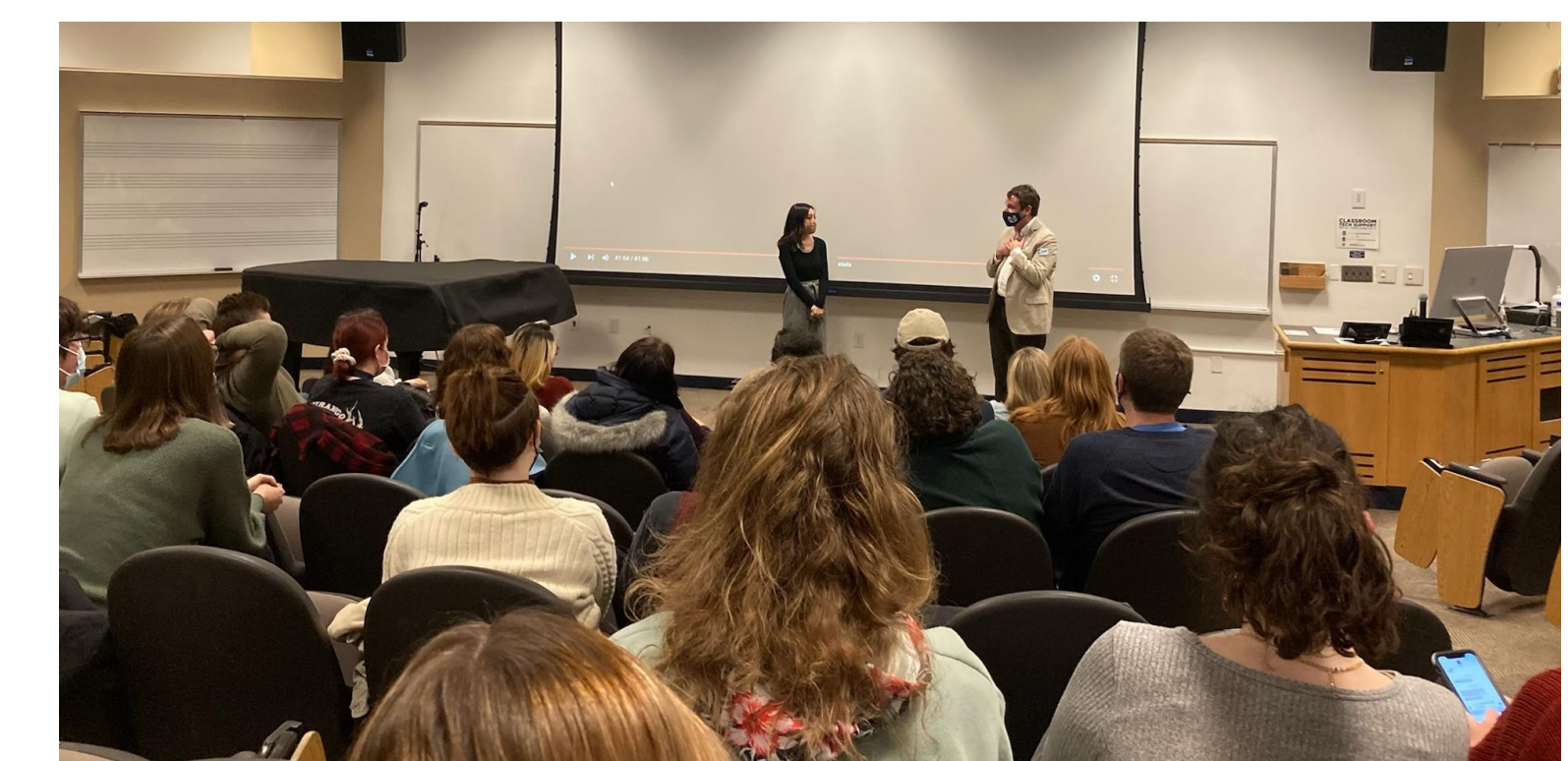
Margin of Error screening at USU