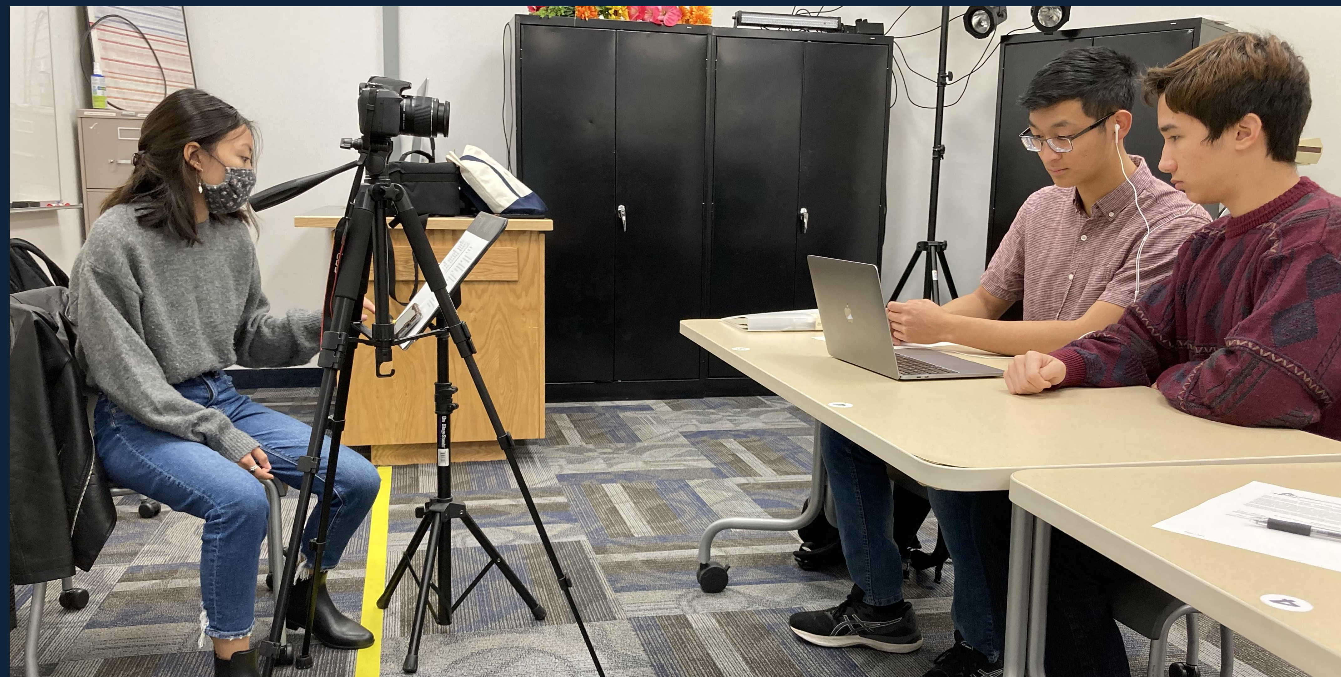
Filming with respondents

Margin of Error is a docudrama that involves actor portrayals of interviews with multiracial college students who discuss navigating their multiple racial identities at often predominantly white universities.