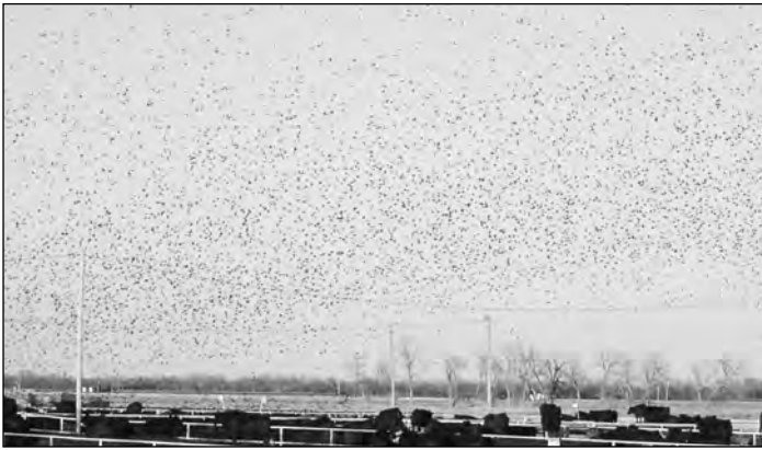
Figure 1. Hundreds of starlings hover over a cattle feedlot.

epidemiological evidence has directly linked starlings in the spread of pathogens among feedlots. If starlings were acting as pathogen vectors to cattle, the most likely transmission route would be through livestock ingestion of starling feces from contaminated water and feed (Foster et al. 2006).