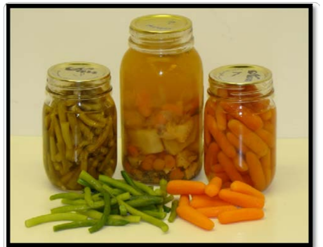
Photo: Green beans, chicken soup and carrots pressure canned at USU.