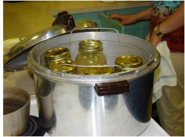
Photo: Getting ready to pressure can at the USU Home Food Preservation Workshop, May 2008.

Gaskets: Handle canner lid gaskets carefully and clean them according to the manufacturer’s directions. Nicked or dried gaskets will allow steam leaks during pressurization of canners and should be replaced. Keep gaskets clean between uses. A lid which is difficult to remove after cooling may indicate a gummy, or dry gasket and is reason to replace it.