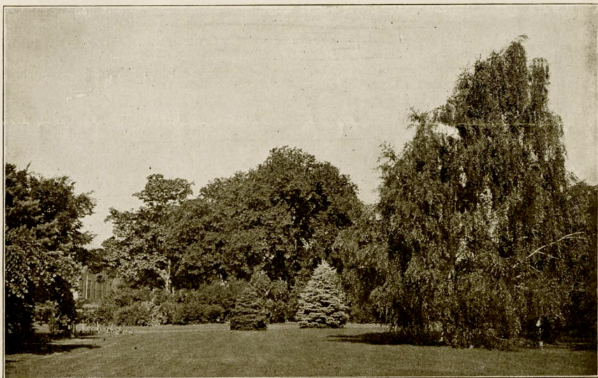
A Scene on the Campus UNIVERSITY OF MISSOURI

The University of Missouri is the oldest State University in the Louisiana Purchase Territory. Value of property, $2,500,000.