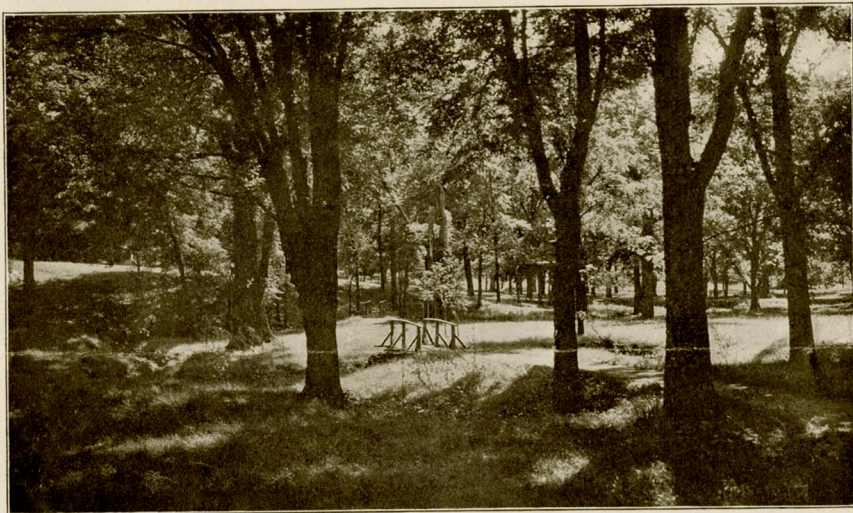
Entrance to University of Missouri Campus from Northeast

The University of Missouri is the oldest State University in the Louisiana Purchase Territory. Value of property, $2,500,000.