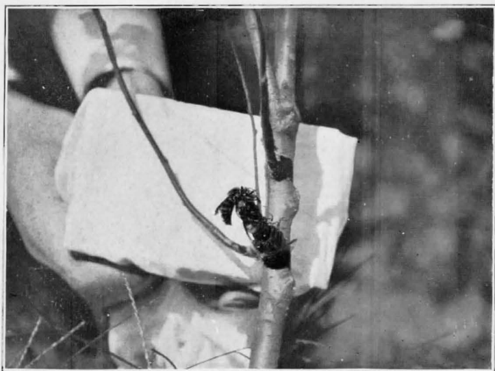
C. PLATION OF BOMBUS FLAVUS.