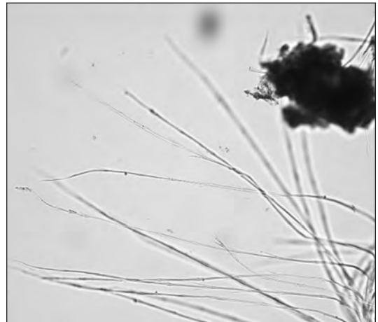
Figure 3. Photomicrograph of a downy feather sample collected from the tail section of the Cessna Citation that crashed near Wiley Post Airport, Oklahoma. The diagnostic microscopic characters of the downy barbs in this sample include short barbules with long, distal prongs.

3). These microscopic characters are typical of several birds that could occur in Oklahoma during the month of this accident (April) and includes the avian Orders: Gaviiformes (loons),