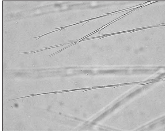
Figure 4. Photomicrograph of downy barbules of American white pelican ( Pelecanus erythrorhynchos ) showing the microscopic similarity to the unknown sample (Figure 3) from the Wiley Post accident.

After the DNA samples provided a confident species match, we reexamined the microscopic structures of the downy barbules found in the Wiley Post Airport accident case and confirmed that the feather characters were consistent with those of American white pelican (Figure 4). We eliminated the common loon and various species of grebes because those species typically have stippled pigment in the internodes of the downy barbules. We eliminated double-crested cormorants because the distal downy prongs are typically shorter and fewer in number than those of the Cessna sample. That species also does not have white feathers in the plumage at that time of the year, which was inconsistent with the white, partial pennaceous feather in our sample.