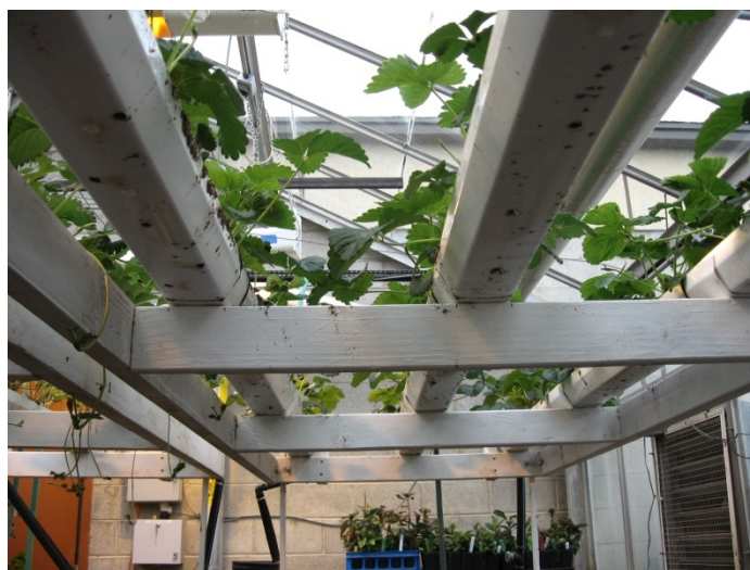
Figure 2 Suspended growing system

Plug plants are relatively easy to grow and can be produced in a small greenhouse or cold frame. Dormant cold-stored mother plants are planted in the late spring/early summer to produce runner tips for propagation. If mother plants are ordered in January or