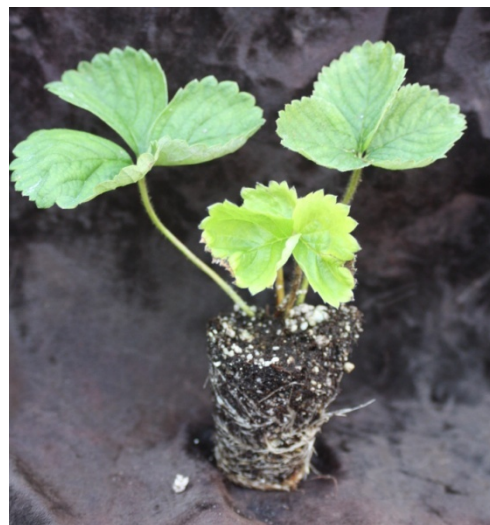
Figure 1 Strawberry Plug Plant

Annual hill strawberry plantings are generally established by using either fresh dug or dormant cold-stored “frigo” plants. Both fresh dug and dormant plants are relatively inexpensive. However, fresh dug plants are generally not commercially available until October when they are dug by nurseries for large California and Florida plantings. October is too late for planting in Northern Utah, where optimal planting dates are in late August to early September. Dormant plants are generally dug in the late fall or winter and cold stored for planting in the spring and early summer. However, by September most of the plants have been in cold storage for such a long period of time that plant viability is decreased (Hokanson et al., 2004).