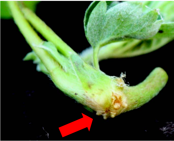
Figure 4 Root Pegs on Strawberry Runner Tips

Runner tips should be harvested when root initials (little white or brown pegs, Figure 4) are present on the runner tip. Root initials should not be longer than ½ inch. Additionally, at least two trifoliate leaves (first leaves that appear from the runner tip) are needed and should be between 2½ and 4 inches in length (Durner et al., 2002) (Figure 5). Runner tips where the oldest trifoliate leaf is larger or smaller will have limited success in establishment. Depending on individual needs and desire for uniformity of runner tips, tips are generally harvested every 10 to 14 days. Sorting tips by size will prevent larger plug plants from crowding out the smaller ones in the tray (Durner et al., 2002; Takeda and Newell, 2006). Fifty cell plug trays with approximately 7 cubic inches per cell work best for strawberry plug production.