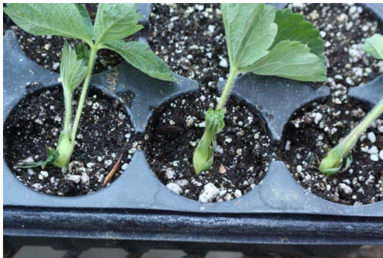
Figure 6 Anchored Runner Tips

Runners should be removed such that the trifoliate leaves are not damaged and approximately ½ inch of the runner is left to be used for an anchor when planting tips into plug trays (Figure 5) (Durner et al., 2002; Takeda and Newell, 2006). Runner tips should be planted immediately after harvest. In commercial operations, runners are usually planted or cooled to 32°F within 45 minutes. If runner tip storage is necessary, tips should be stored at 32 to 34°F at 95 percent humidity for no more than 1 week (Durner et al., 2002). Tips should be planted such that the root pegs and anchor are just below the soil surface, with the leaves and as much of the developing crown as possible remaining above the soil surface (Figure 6). The soil should then be pressed lightly around the runner tips to hold the plant in place.