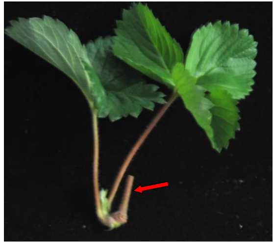
Figure 5 Properly sized runner tip. Note 2 fully expanded trifoliate leaves as well as extra ½” of runner that is used to anchor the plant (arrow).

Runners should be removed such that the trifoliate leaves are not damaged and approximately ½ inch of the runner is left to be used for an anchor when planting tips into plug trays (Figure 5) (Durner et al., 2002; Takeda and Newell, 2006). Runner tips should be planted immediately after harvest. In commercial operations, runners are usually planted or cooled to 32°F within 45 minutes. If runner tip storage is necessary, tips should be stored at 32 to 34°F at 95 percent humidity for no more than 1 week (Durner et al., 2002). Tips should be planted such that the root pegs and anchor are just below the soil surface, with the leaves and as much of the developing crown as possible remaining above the soil surface (Figure 6). The soil should then be pressed lightly around the runner tips to hold the plant in place.