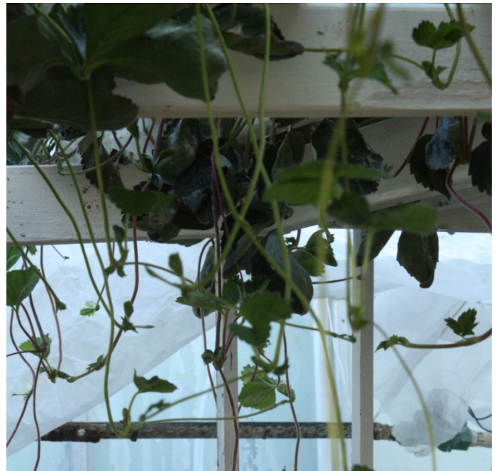
Figure 3 Suspended growing system with hanging runners

Greenhouses provide the ideal setting for runner production. Greenhouses can be managed to provide ideal day time temperatures (above 75°F) and long photoperiods (about 16 hours). With supplemental heat and light, runner production can occur year round. Elevated planting beds in the greenhouse facilitate runner harvesting. PVC rain gutters filled with a soil-less potting mix provide a simple and efficient elevated production system (Figure 2). Plants are spaced 9 to 12 inches apart in the gutters. The resulting small root volume requires frequent irrigation and fertilizer application. Drainage holes should be drilled in the bottom of the gutters to prevent water saturation of the soil. Irrigation events will vary with different planting configurations; however, the principles are the same.