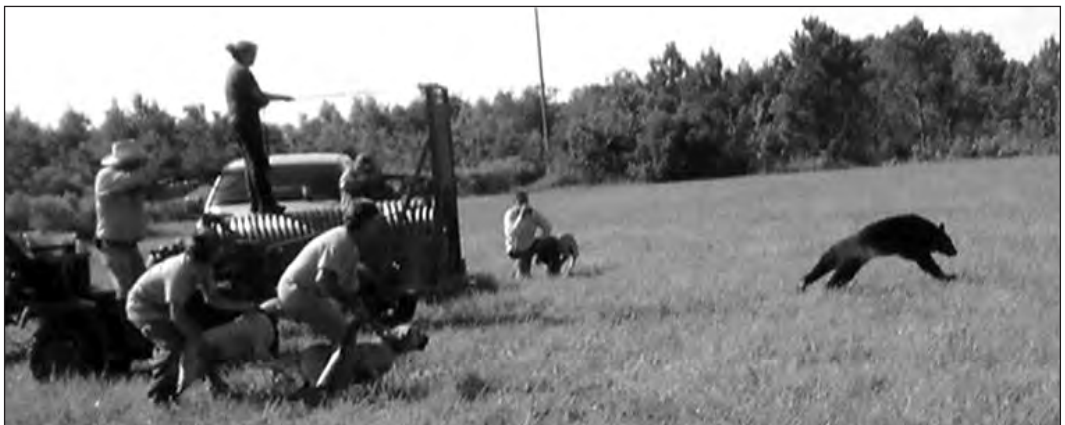
Figure 2. A bear is released from a culvert trap after being tagged and radio-collared.

We estimated distance between consecutive locations to evaluate bear movements relative to treatment and to provide insight into how bears traversed their home range following release. To evaluate space use, we estimated 95% and 50% contours (core area of use) using fixed kernel estimators (Seaman and Powell 1996, Powell et al. 1997) for each bear in the home range, animal movement, and spatial analyst extensions in ArcMap 9.1 (Environmental Systems Research Institute, Redlands, Calif.). To estimate mean distance bears moved from capture sites during the first 24 hours and 2 weeks following release,