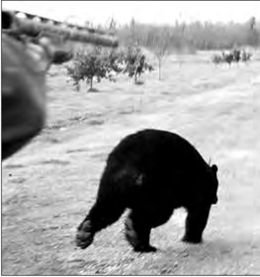
Figure 3. Shotguns were used to deliver rubber buckshot to a nuisance black bear upon its release from capture as part of an aversive conditioning treatment.

we spatially joined telemetry locations of each bear for each time period to respective capture sites using ArcMap 9.1.