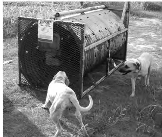
Figure 1. Culvert traps (pictured) allowed bears to recover from immobilizing injections after capture and tagging.

Using a combination of culvert traps (Figure 1) and modified Aldrich snares (Johnson and Pelton 1980), we captured black bears from April 2005 to February 2006 in areas of St. Mary, Iberia, and Vermilion parishes that reported nuisance