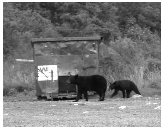
Black bears seek food in a garbage bin.

aversive conditioning, such as lithium chloride, loud noise, pepper spray, rubber buckshot, and dogs have been used on nuisance black bears by state and federal agencies across North America, but limited research has been conducted testing effectiveness of these methods in deterring nuisance bear behavior (Colvin 1976, Hunt 1984, Gillin et al. 1994, Ternent and Garshelis 1999, Beckmann et al. 2004). Louisiana, much like other states, uses aversive conditioning techniques with limited knowledge of the effectiveness on bear behavior following release and conditioning. The intent of on-site release coupled with aversive conditioning of bears