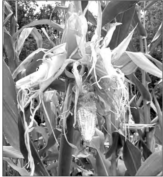
Damage to corn by wildlife.

The rate of crop damage was positively associated with the amount of forest edge in this study. Landscapes with larger amounts of edge are likely to support larger populations of wildlife species with affinities to edges and provide more opportunities for wildlife species to access crop fields. Consequently, edge availability may increase wildlife foraging pressure on crops. The species causing most