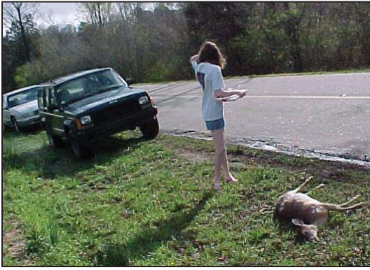
Scene of deer–vehicle collision.

facilitate a driver's maneuverability and should lessen the probability of a crash, they also put the deer in the danger zone for a longer period. Also, roads with 4 lanes generally have more vehicular traffic. They concluded that mitigation strategies for reducing DVCs should be focused on areas with a high number of bridges. This is understandable because more bridges mean more wetlands and more deer habitat. Furthermore, deer use these locations as corridors when they move across habitats fragmented by roads.