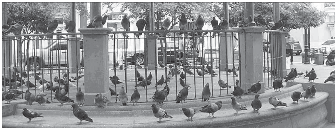
Pigeons overrunning a public space.