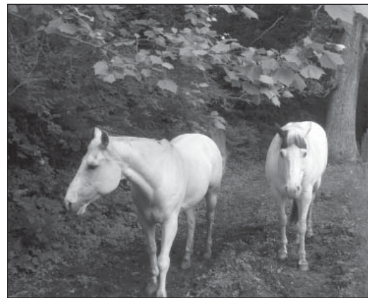
Feral horses in Kentucky.

A potential ban on the slaughter of horses for food may increase feral horse populations, according to an Associated Press report in March 2007.