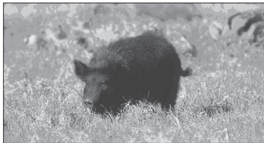
Feral hog in field.

The Tribune-Democrat of Johnstown, Pennsylvania, reported several disturbing trends about the state's 2006 feral hog hunt. Initially,