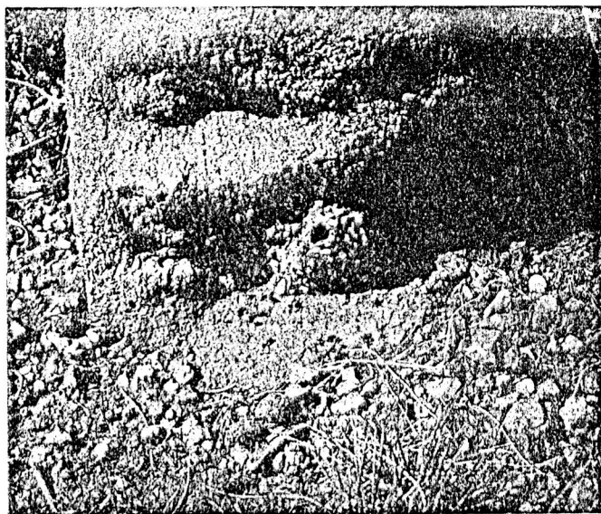
Fig. 1. Nest of Dianthidium cressonii , built of resin and pebbles on the surface of a stone.

The hair of the labrum is black; clypeus extremely densely punctured, with a little space in middle shining and not so closely punctured; spurs ferruginous.