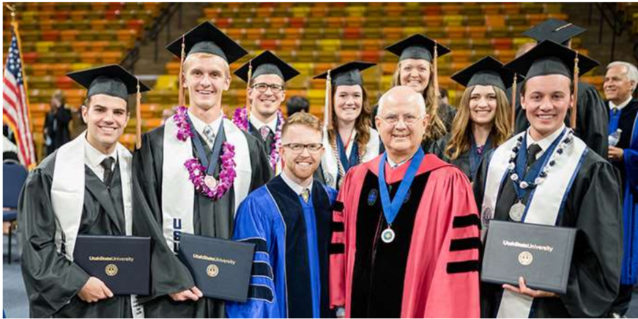
Jon M. Huntsman Memorial Video