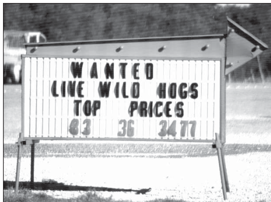
FIGURE 3. Commercial demand for “wild boar” meat in upscale restaurants in the northeastern United States and abroad has spawned a demand for feral hogs.

Hunters and landowners who cater to hog hunters view feral hogs as a challenging, tasty species of big game that may be hunted year-round in Texas. The mean value of a feral hog hunt to landowners in 1994 was $164 (Rollins 1994), and some landowners derive income by developing hunting enterprises around feral hogs (Chambers 1999). Hunting feral hogs is especially popular among bow hunters. The demand for so-called wild boar meat, especially in European markets, has increased the price for live feral hogs; and prices offered usually exceed those for domestic pork (Weems 1999; Figure 3). Accordingly, trapping feral hogs in various cage-traps has become increasingly popular in recent