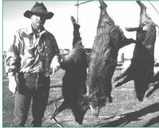
FIGURE 4. Feral hogs are often butchered on site as a convenient source of pork, but they can provide an opportunity for disease transmission.

Also in 2006, we conducted statewide awareness programs at 24 locations in 23 counties and reached a total of 1,725 clientele.