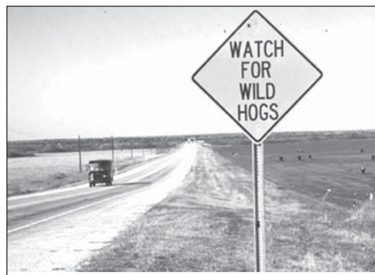
FIGURE 1. Feral hogs are common in many parts of the United States.

and cattle ranchers are concerned about the spread of swine brucellosis and pseudorabies (Hartin et al. 2007). Feral hogs are second only to coyotes ( Canis latrans ) as predators of sheep and goats in some areas of Texas (Mapston 2004). A 2004 survey of Texas landowners found that since feral hogs first appeared on private property, damage estimates averaged $7,515 per landowner statewide, with an estimated