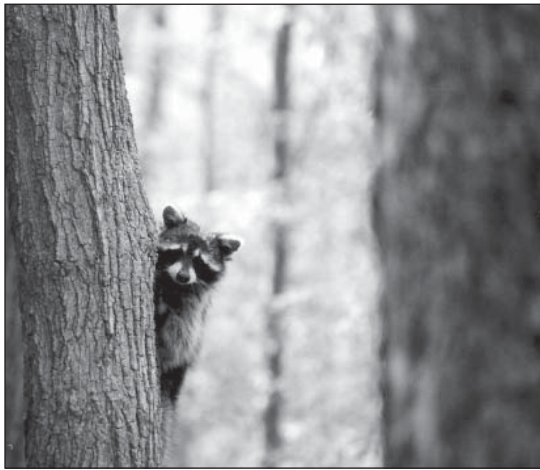
Raccoons are major wildlife consumers of field corn in northern Indiana.

fields) in 2003 and 78 fields (47; 31) in 2004 for evidence of wildlife damage to crops. Surveyed corn fields averaged 21.3 ha (SD = 18.9) in size; soybean fields averaged 24.3 ha (SD = 19.2). Most fields were rectangular, although some fields had curvilinear borders adjacent to woodlots, roads, drainage ditches, and grassed waterways.