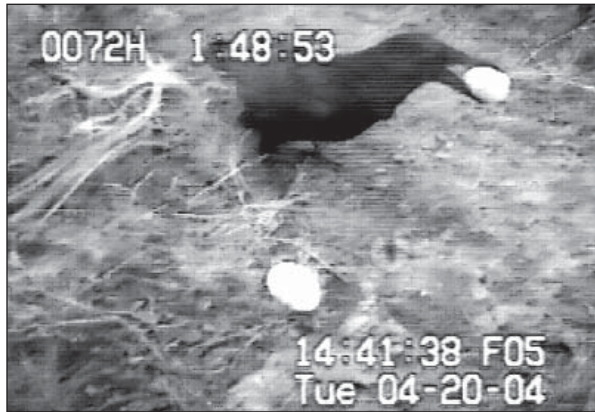
A raven is pictured in the act of taking an egg bait (left), then eating it (below).