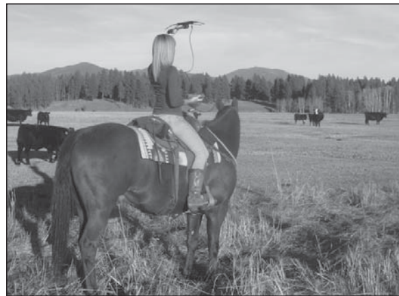
Figure 4. An important aspect of the range rider effort was the capture and radio-collaring of adult wolves ( Canis lupus ) by FWP in areas with known packs. By knowing the location of the radio-collared wolf, range riders could more regularly maintain a human presence in targeted areas to help discourage livestock depredations by wolves and to improve assessment of livestock condition and vulnerability to wolves (photo courtesy of T. Parks).

This initial effort was important for several reasons. First, by starting with a respected ranch family and hiring a local family member who was highly competent and well known in