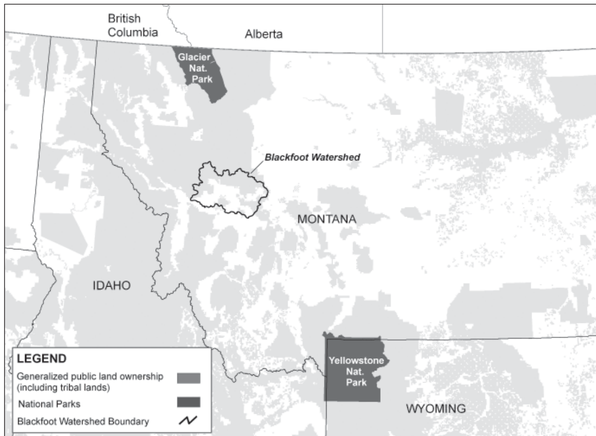
Figure 1. Location of Blackfoot Valley Watershed in western Montana.

continued to pose a challenge for those raising livestock. Often, private lands in livestock production in valley bottoms or foothills adjacent to public lands were problematic zones for wolves and livestock because wolves can easily access private agricultural land (Bradley and Pletscher 2005, DeCesare et al., in press). Repeated incidents with livestock typically lead to wolf removals. In these cases, outcomes are unfortunate for both those losing livestock and for the wolves themselves. One solution to breaking this cycle is to focus efforts on preventive measures that proactively address wolf–livestock conflict. This position implicitly recognized that long-term conservation and management of wolves in places like Montana will require some level of human acceptance, tolerance, and ultimately some changes in husbandry practices that help reduce the likelihood of depredations by wolves on livestock.