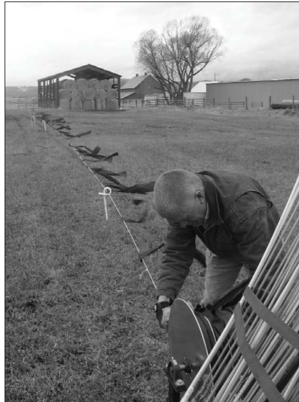
Figure 3. Fladry fences were also used to create a psychological avoidance response (novel stimuli) in wolves ( Canis lupus ). Electrified fladry, using a line of poly-wire, reinforces a fear response in wolves by adding an electric shock. The fladry spooling system depicted above was developed by rancher Jim Stone.

Livestock were checked daily by the range rider throughout the grazing season (May 1 to October 31) on public grazing allotments on horseback, all-terrain vehicles, and a truck. There were no known livestock depredations by wolves on this ranch for that first season.